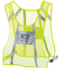
Running Reflective Vests