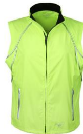
Clothing with Reflective Piping