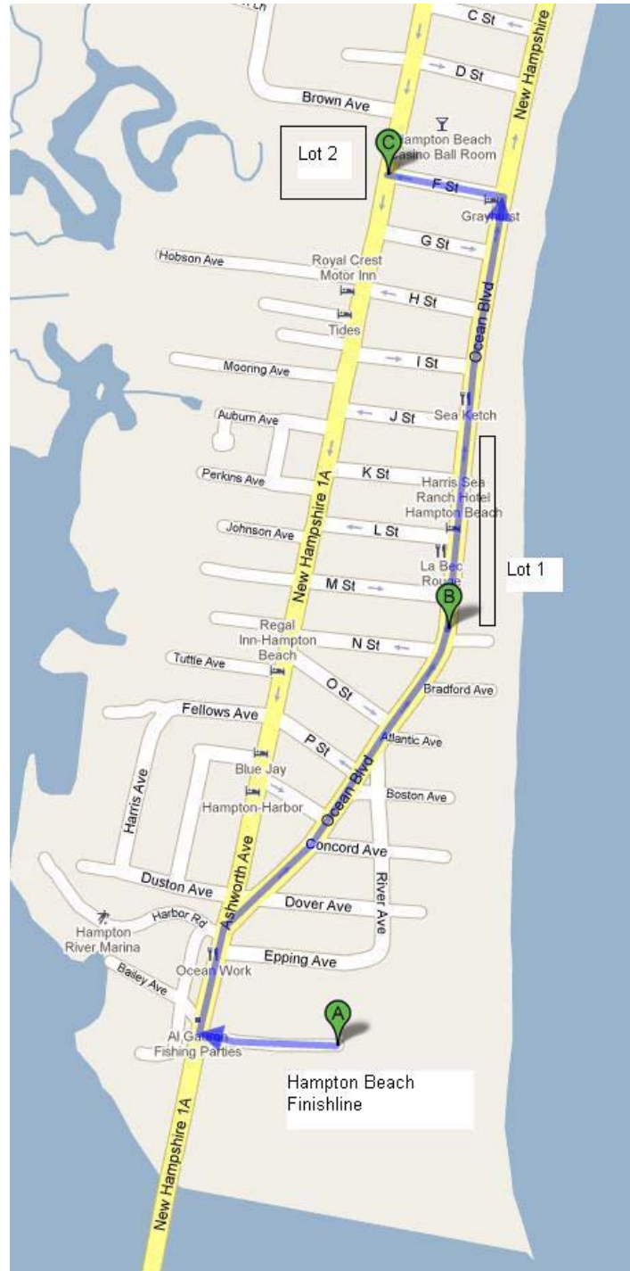
Fig 14.1 – Directions from the finish ‘A’ to parking Lot 2 (C).