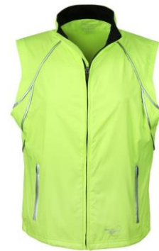
Clothing with Reflective Piping