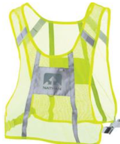
Running Reflective Vests