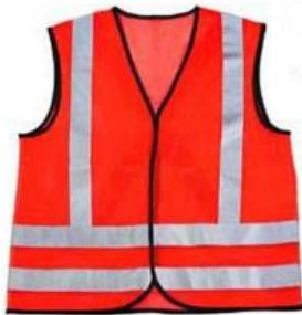
Standard Reflective Vest