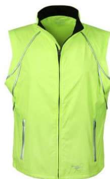
Clothing with reflective Piping