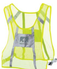
Running Reflective Vests