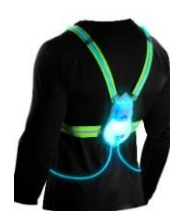
Glow harness WITH reflective straps

The following items are NOT approved for use in Ragnar races : homemade products, reflective sleeves, reflective belts, adhesive reflective tape, or reflective piping.