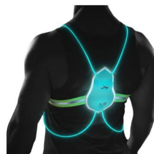
Glow Harness without reflective straps